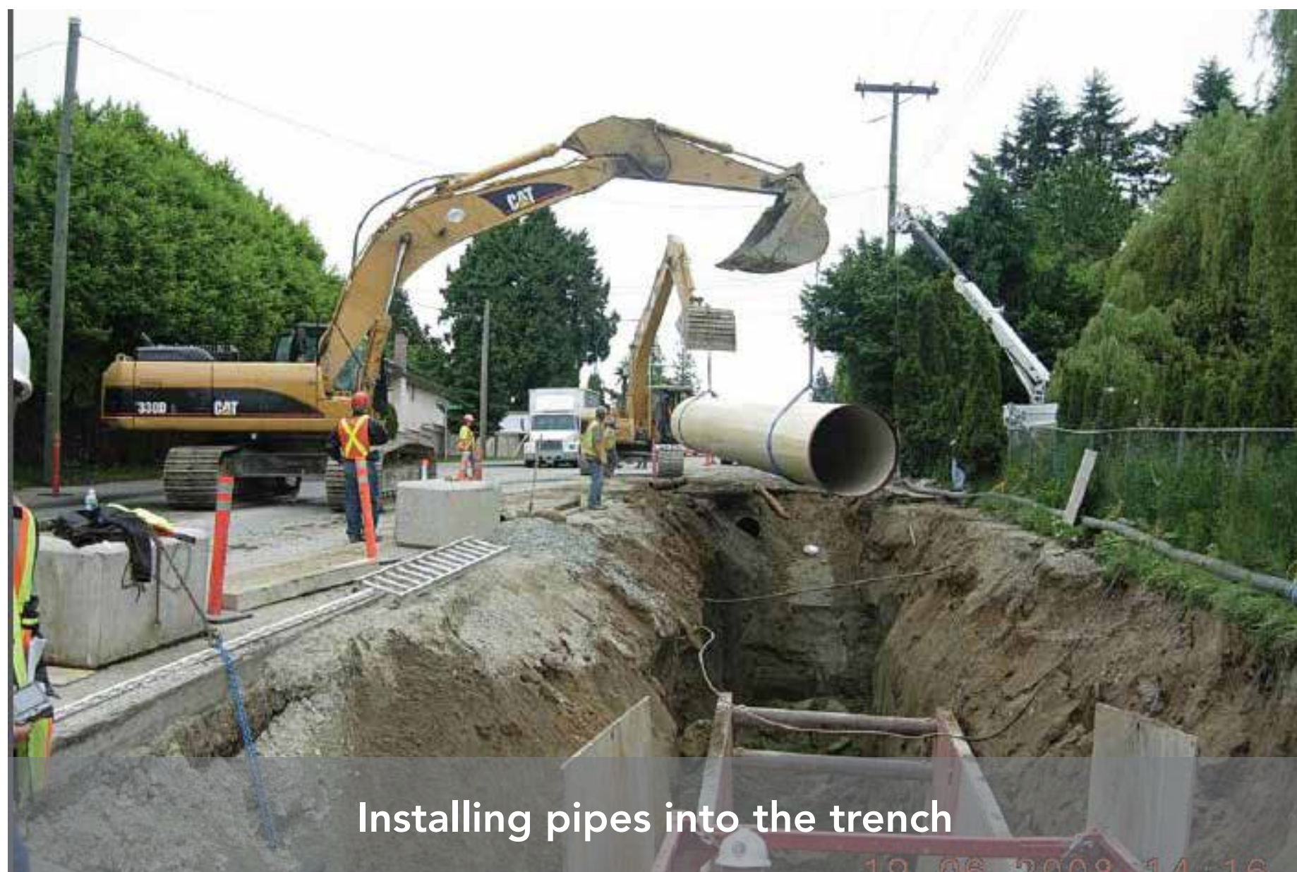
Installing pipes into the trench