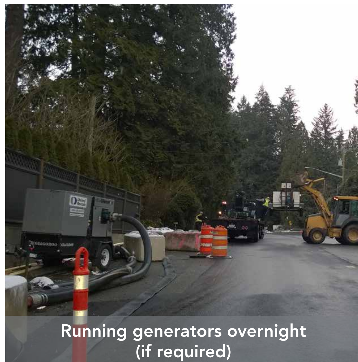
Running generators overnight (if required)