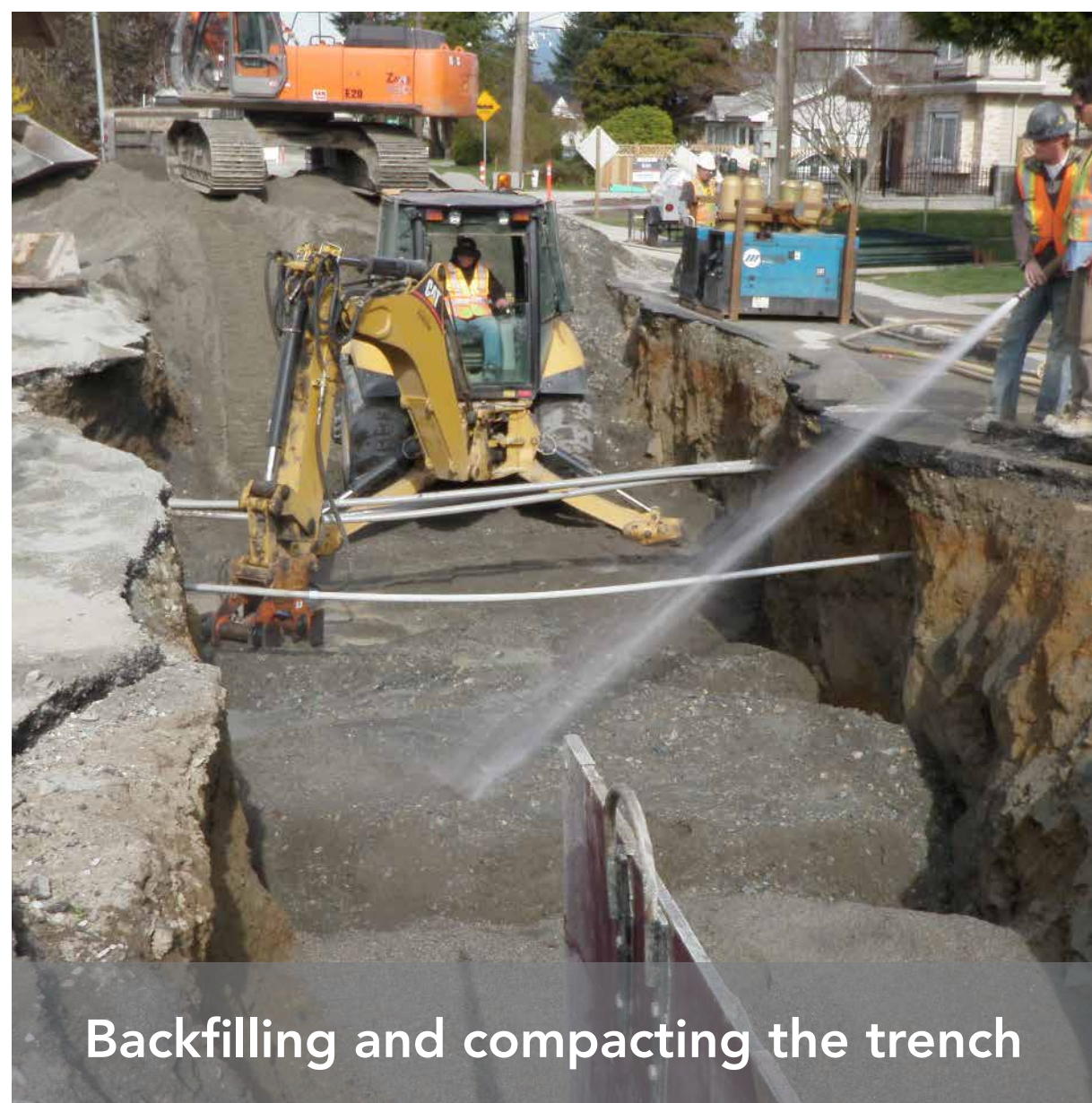
Backfilling and compacting the trench