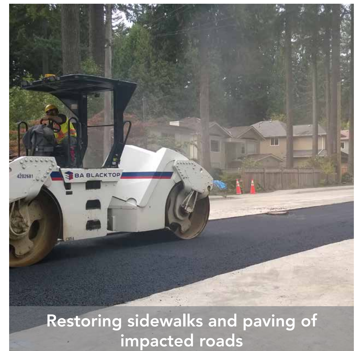
Restoring sidewalks and paving of impacted roads