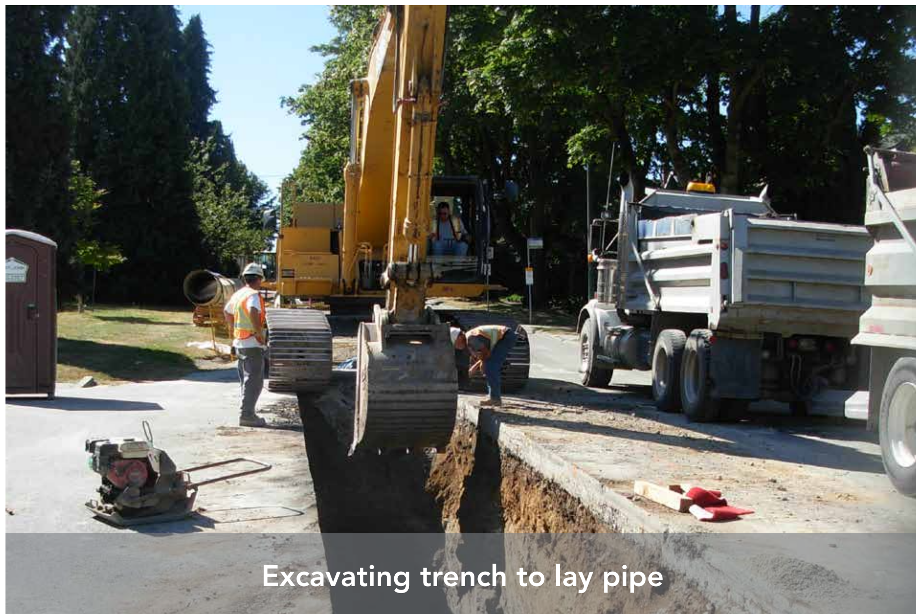
Excavating trench to lay pipe