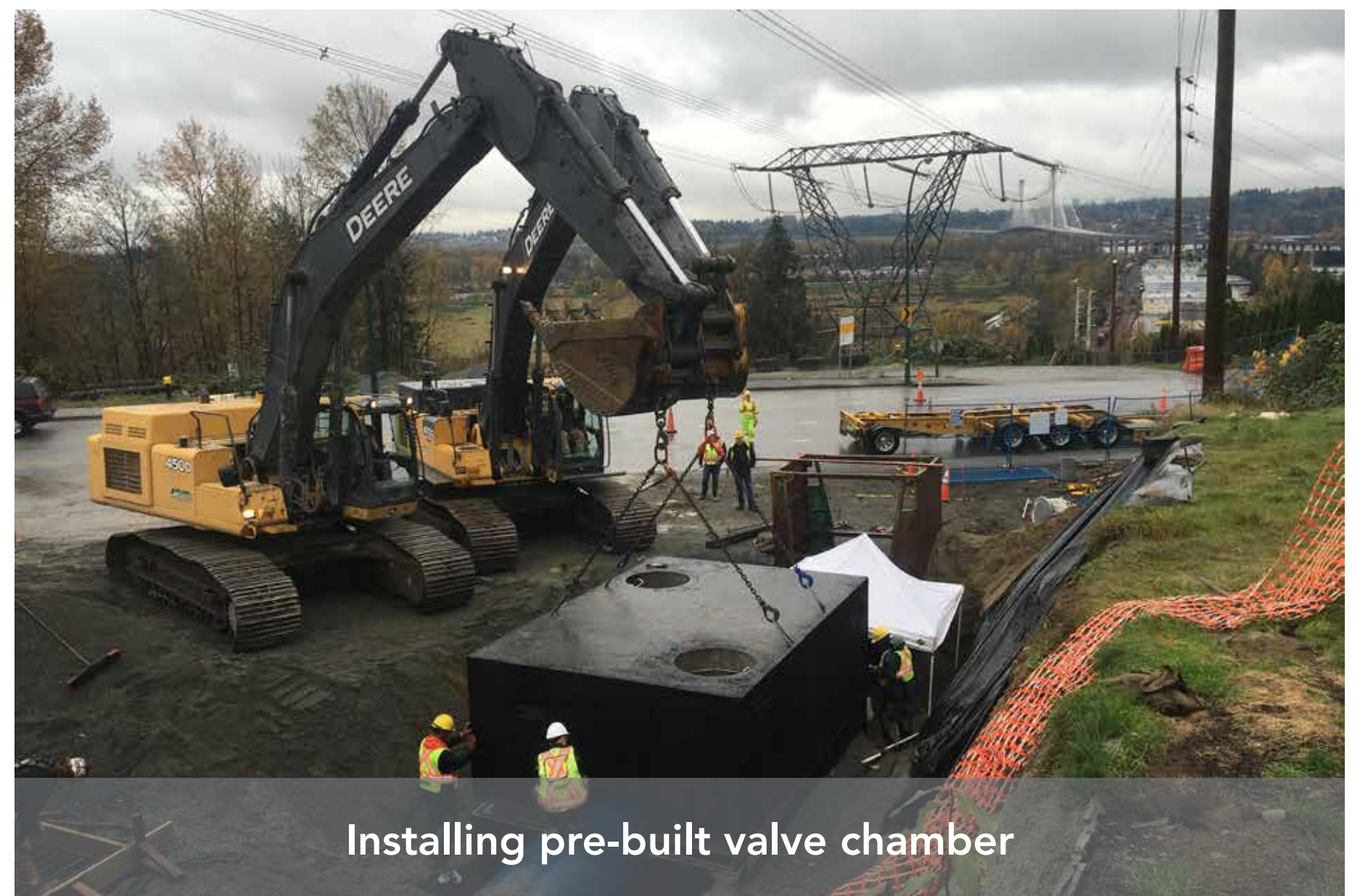
Installing pre-built valve chamber