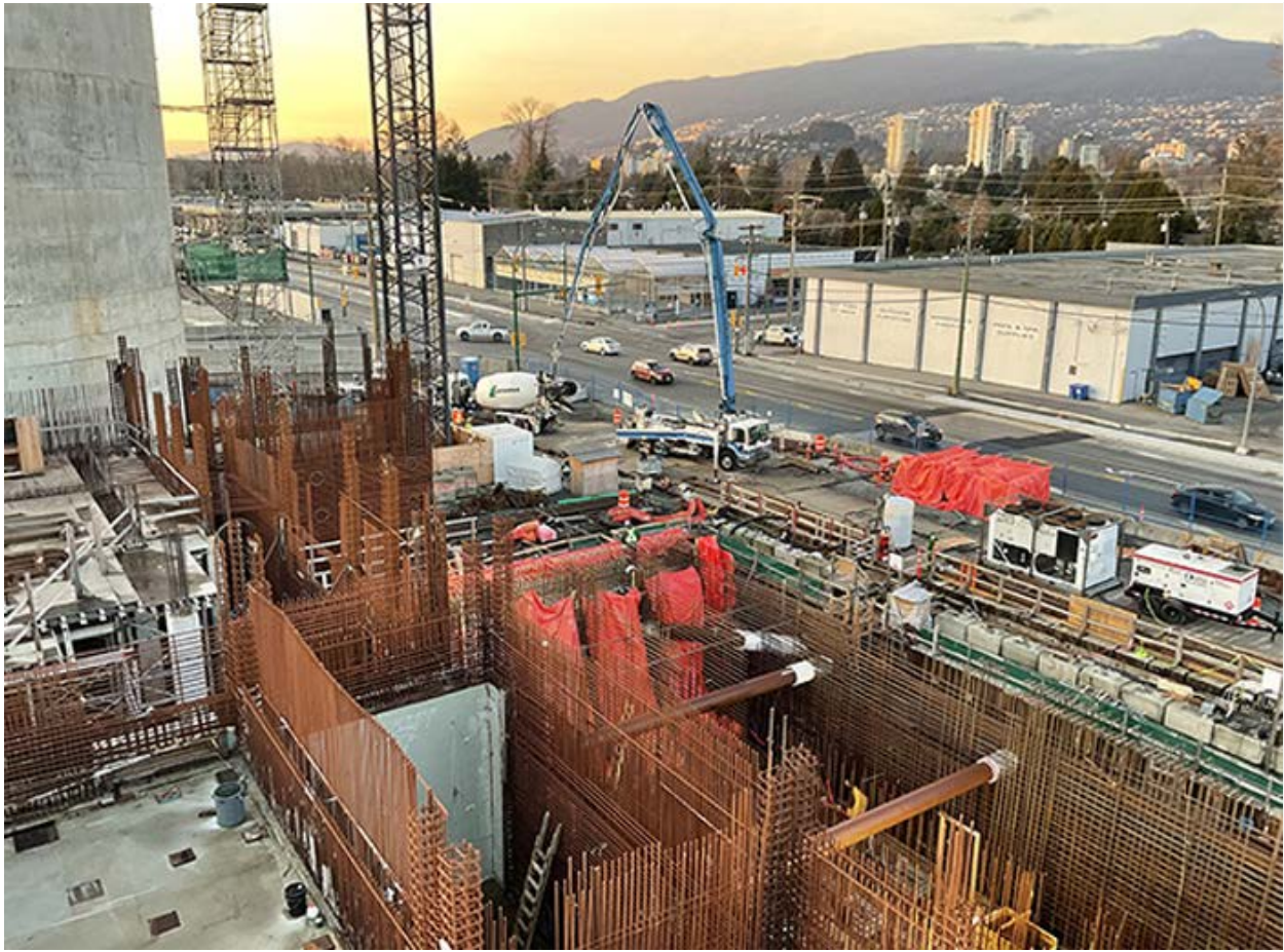
Crews pouring concrete at the treatment plant site in mid-December.