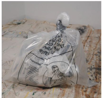
DOUBLE BAGGED WITH THIS BAG ONLY

Call 604-681-5600 or go to mvrecycles.org and search “used gypsum bag”