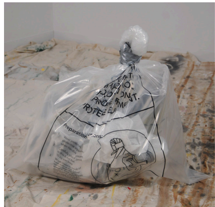
DOUBLE BAGGED WITH THIS BAG ONLY

Call 604-681-5600 or go to mvrecycles.org and search “used gypsum bag”