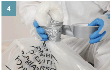
4 Attach it to the base of the tail using duct tape.

Residents may drop off used gypsum for disposal at Metro Vancouver transfer stations or the Vancouver Landfill. Used gypsum is NOT accepted at the Vancouver South Transfer Station or any gypsum recycling facilities.