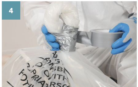
4 Attach it to the base of the tail using duct tape.

Residents may drop off used gypsum for disposal at Metro Vancouver recycling and waste centres or the Vancouver Landfill. Used gypsum is NOT accepted at the Vancouver South Transfer Station or any gypsum recycling facilities.