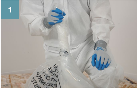
1 Twist the unused top portion of the bag into a tail.

Only used gypsum program bags tied goose-neck style following these instructions will be accepted for disposal.