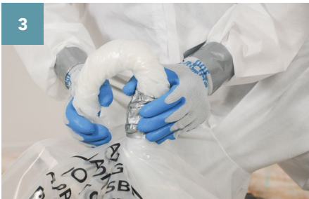
3 Take the leftover twisted tail section of the bag and bend it around to make a loop.