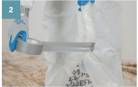
2 Seal the base of the tail with duct tape.