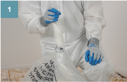
1 Twist the unused top portion of the bag into a tail.

Only used gypsum program bags tied goose-neck style following these instructions will be accepted for disposal.