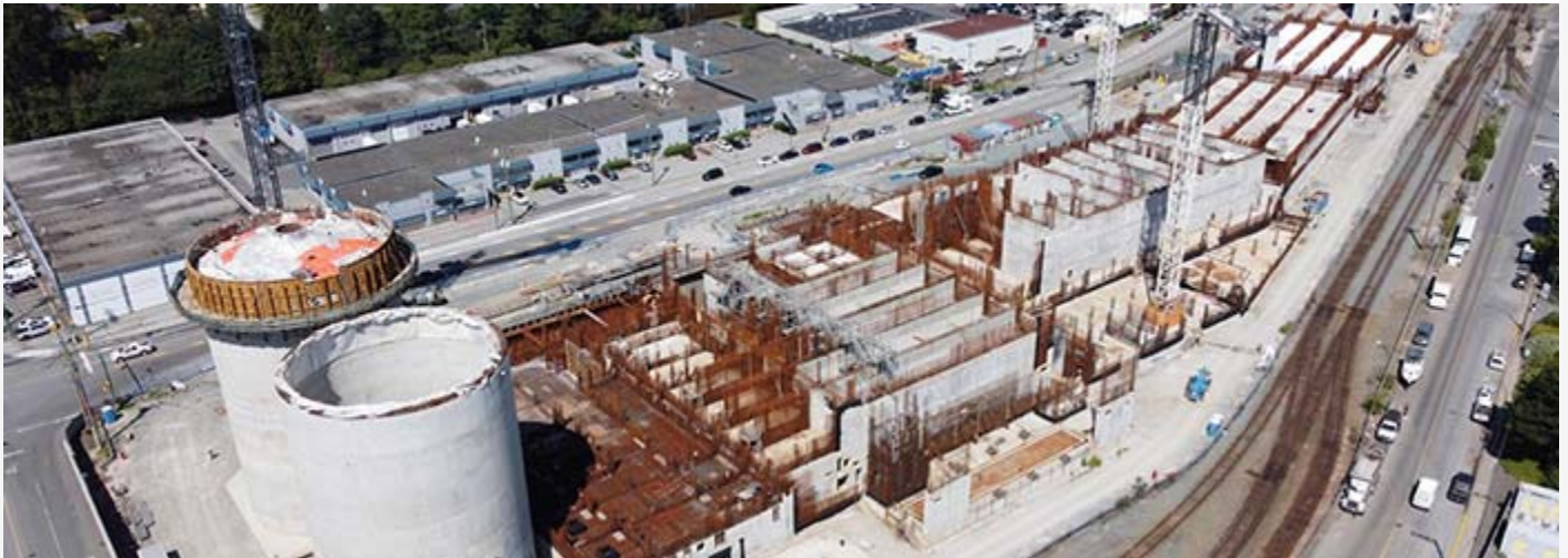
Aerial photo of the treatment plant site from July 2022. Crews are continuing with ongoing site maintenance and preparing for some early works construction later this summer.

Early works are defined packages of work that allow construction to progress while we continue the development of a new plan to complete the project, including a revised project budget and schedule. We anticipate that we will bring the updated budget and schedule to Metro Vancouver’s Board of Directors for consideration in late 2022. Construction activity will not increase to full-scale again until the completion plan has been reviewed and approved.