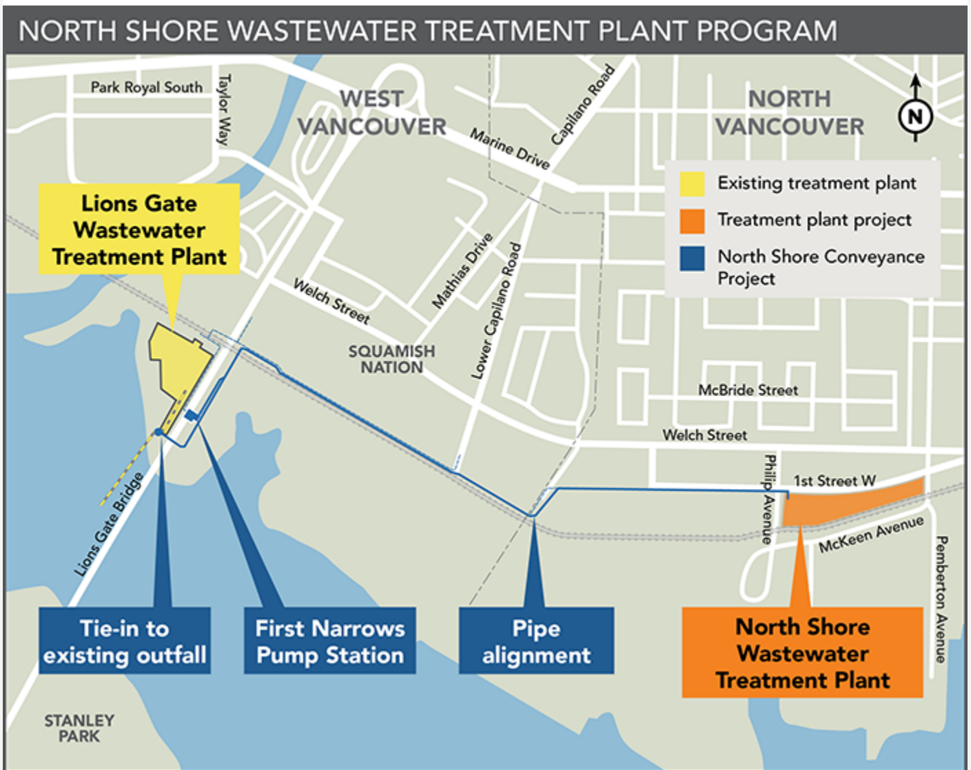
This map shows the locations of the three projects included in the North Shore Wastewater Treatment Plant Program:

The decision to develop tertiary treatment reflects the input we received from key stakeholder groups and Indigenous Nations, as well as our organization’s commitment to protect the environment and strengthen the quality of life in our region for current and future residents.