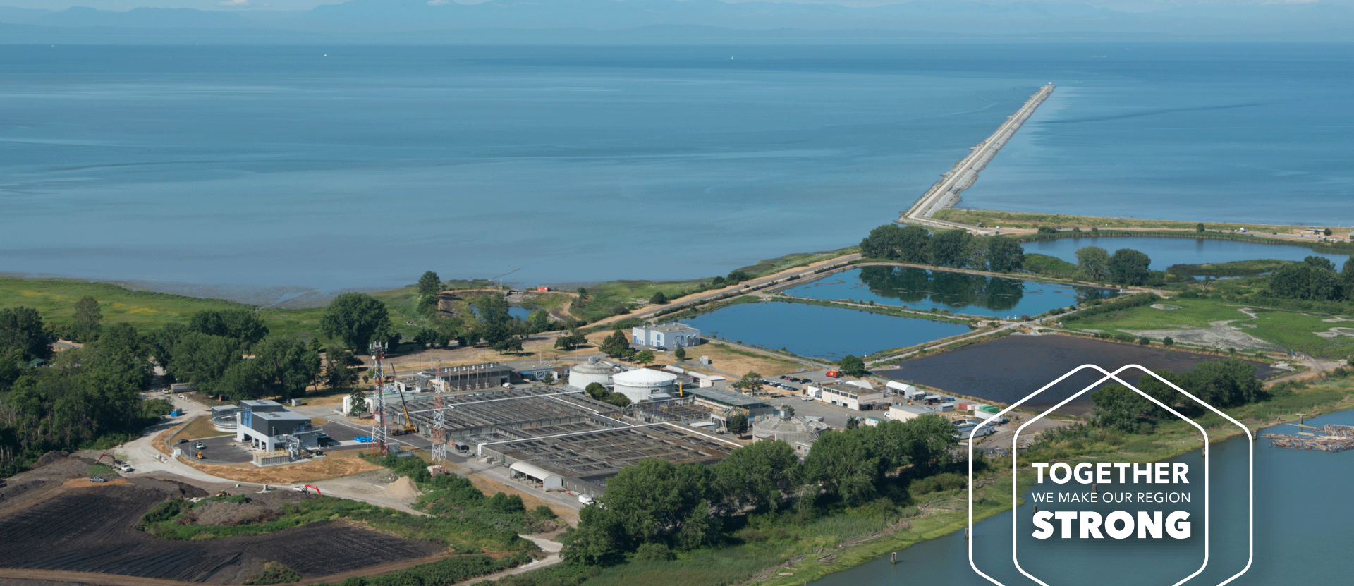
Iona Island Wastewater Treatment Plant